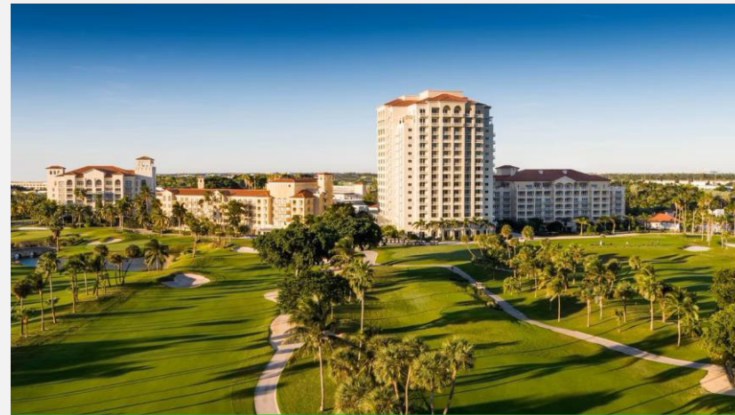
JW Marriott Miami Turnberry Resort & Spa