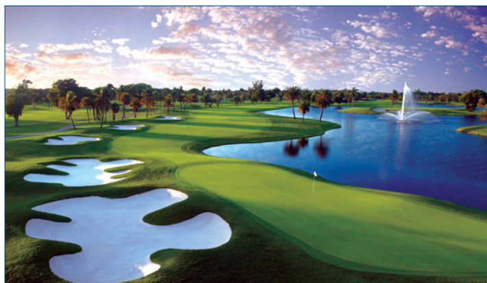
The Blue Monster, at Doral

A great place to conduct business! CNS 2019 will take place at Doral - the home of the fabled Blue Monster, one of the most challenging and spectacular golf courses in existence and host to the PGA tour for the past 55 years.